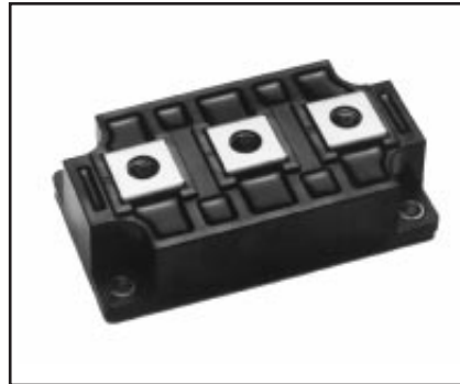
RM300CA-9W Fast Recovery Welder Diode Module 300 Amperes/450 Volts