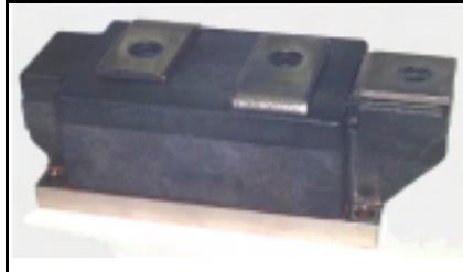
LD42_50 Dual SCR/Diode Pow-R-Blok™ Module 500 Amperes/ 600 – 1600 Volts