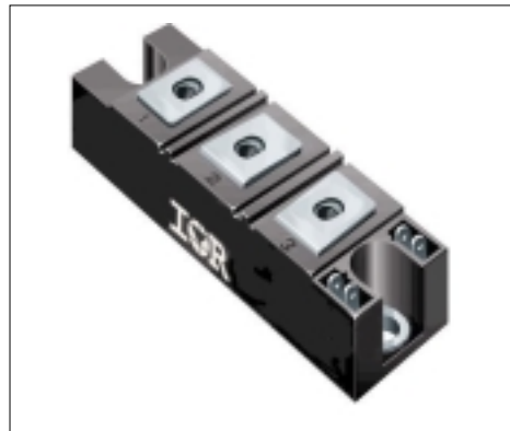
CASE STYLE NEW INT-A-PAK