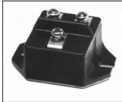
CS241020 Fast Recovery Single Diode Module 200 Amperes/1000 Volts