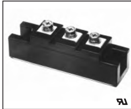
CDD10810 Dual Diode POW-R-BLOK™ Modules 100 Amperes/800 Volts