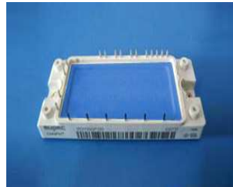
BSM50GX120DN2 Infineon IGBT Modules 1200V 50A