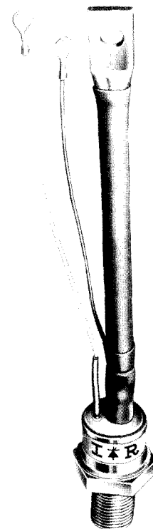
151RC-A, 151RA, 171RK